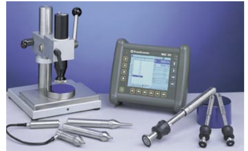
"Hardness testing as a twin pack": The MIC 20 with a selection of rebound impact devices and UCI probes, as well as with the quick support including motorprobe.

The MIC 20 makes for example the calibration easy for you. The setting parameters are then simply filed and recalled by pressing a button or by a "click" in the corresponding application case.